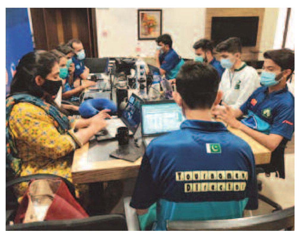
The monitoring team, photo courtesy Tariq Pervez