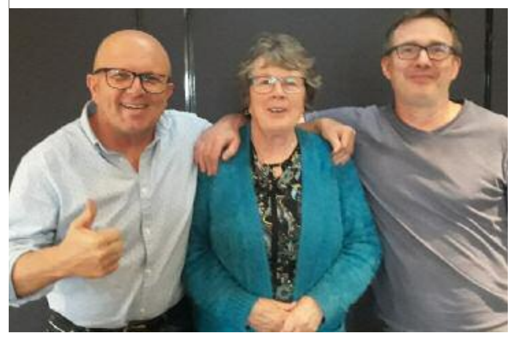
Across the Board ~ December 2022