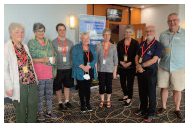
The Organising Committe

Of course when it was all over, I heaved a big sigh of relief and went home exhausted followed by a week's holiday at the Sunshine Coast. I was sorry to hear that about 14 people also went home with Covid and hope they have all recovered now. The tournament was a lot of work but well worth it. Thanks everyone.