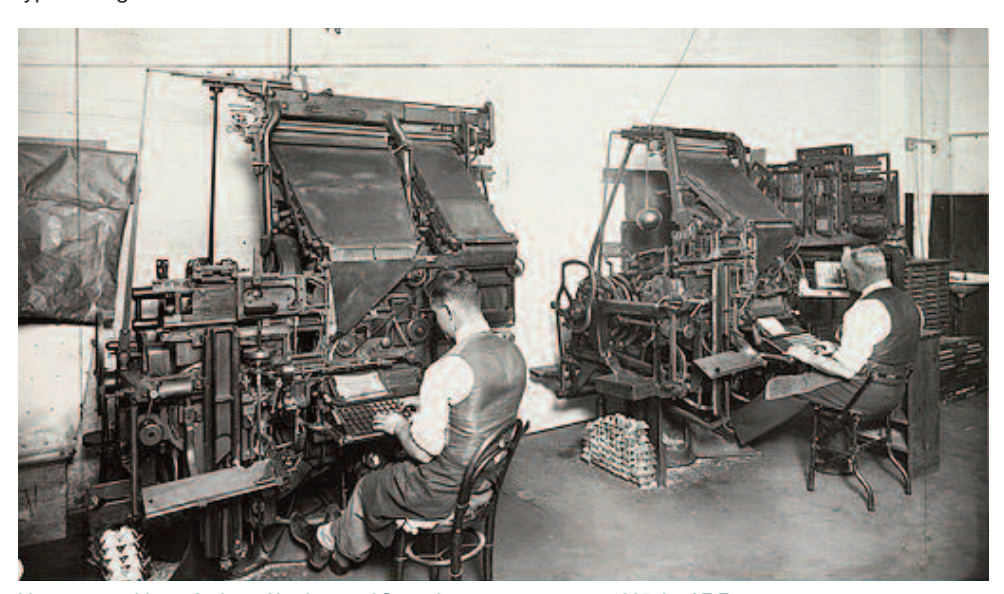
Linotype machines, Anthony Hordern and Sons department store, c. 1935, by AE Foster, State Library of New South Wales

Then came LINOTYPE , used extensively in newspapers. The operator all but sat in the things which were monstrous, but very effective when it came to churning out lots of product. Newspapers had rows of the things. The Sydney Morning Herald where I worked for a while had a team of 8 mechanics on call at peak time. Each machine had a dedicated typeface ( FONT or FOUNT ) and type size. The