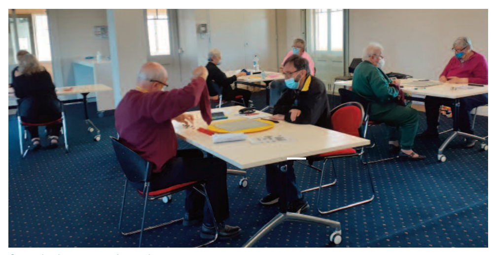
Queensland tournament August 2