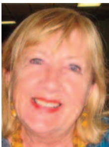
CASPA Coordinator/Mattel Liaison