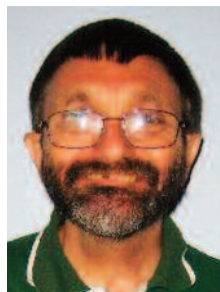
CASPA Ratings Officer/ Web Coordinator/Records Officer