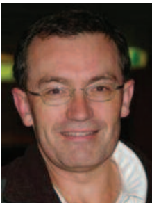
CASPA Youth Coordinator